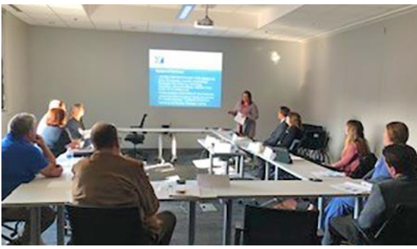
QI team member presenting at board meeting, Pulaski Memorial Hospital, Winamac, IN

In the following article, several of the RQITA national Virtual Quality Improvement (QI) Mentors share strategies for engaging their boards in quality.