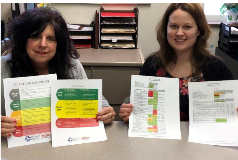
Examples of TAH stop light color-coded reporting and patient education materials.

Titusville has had a recent focus on improving transitions of care as captured through the HCAHPS survey as well as readmissions. To that end, a quality educator tries to attend all discharge planning meetings, particularly Medicare patients and those with a top readmissions diagnoses. This helps with smoothing the process before the patient leaves the hospital and also provides useful information for post-discharge calls, which are completed for all inpatient and observation patients within two days of leaving the facility. This has proven to help reduce readmissions by catching instances of patients not taking newly prescribed medications, increasing rates of attendance at follow-up appointments, assisting with transportation needs, and making appropriate referrals for social services.