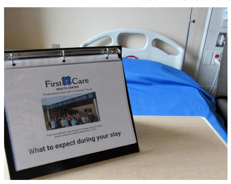
FCHC room guide in an infection-prevention-friendly flip binder.

In conjunction with engagement, the team at FCHC highlights the importance of communication in driving quality outcomes. The impact of communication can be seen in examples including smart phrase transfer notes in the electronic health record to ensure all aspects of the EDTC