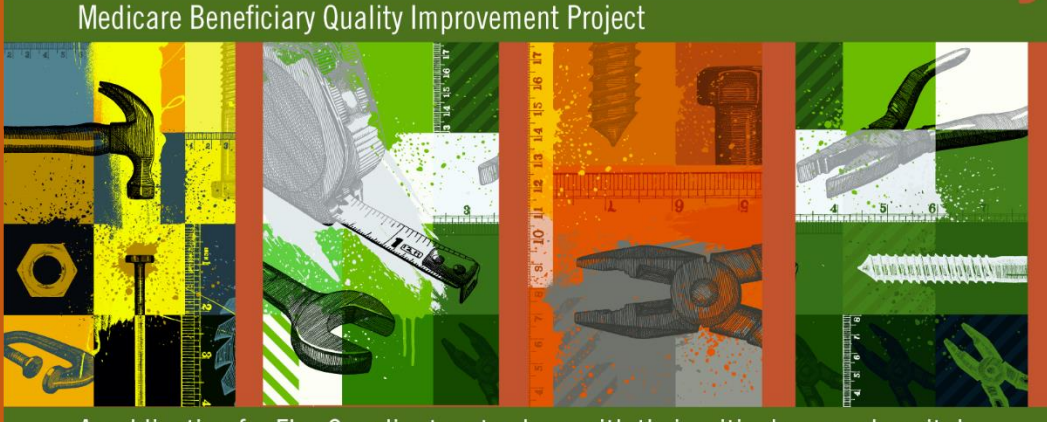
A publication for Flex Coordinators to share with their critical access hospitals

Find past issues of this newsletter and links to other MBQIP resources on TASC's MBQIP Monthly webpage.