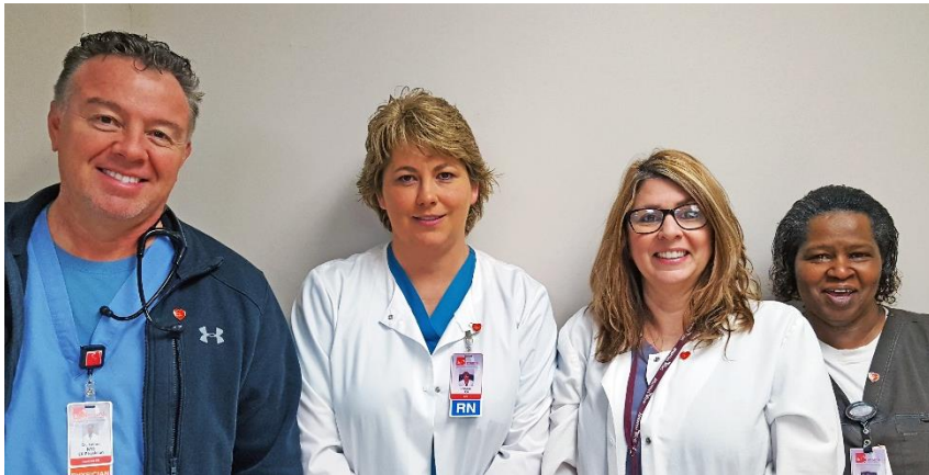
CrossRidge ED staff wearing heart lapel pins for timely AMI care.

potty, positioning and personal space, are documented in the electronic health record (EHR).