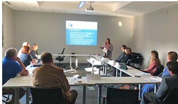
QI team member presenting at board meeting, Pulaski Memorial Hospital, Winamac, IN

In the following article, several of the RQITA national Virtual Quality Improvement ( QI ) Mentors share strategies for engaging their boards in quality.