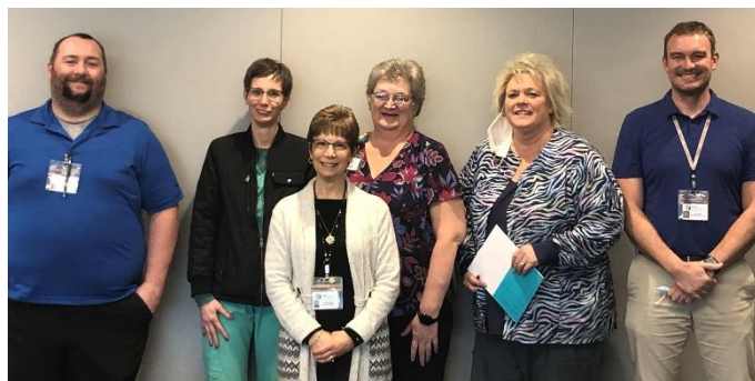
The PMH Readmissions Team