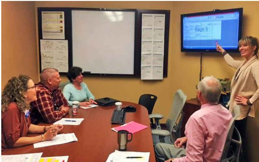
Barrett Hospital Leadership Council reviewing Help Chain Harm, Near Harm, and Near Miss events